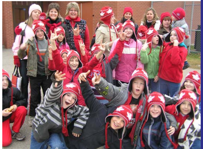
Students and Staff of Sussex Elementary School during Olympic Torch Event.