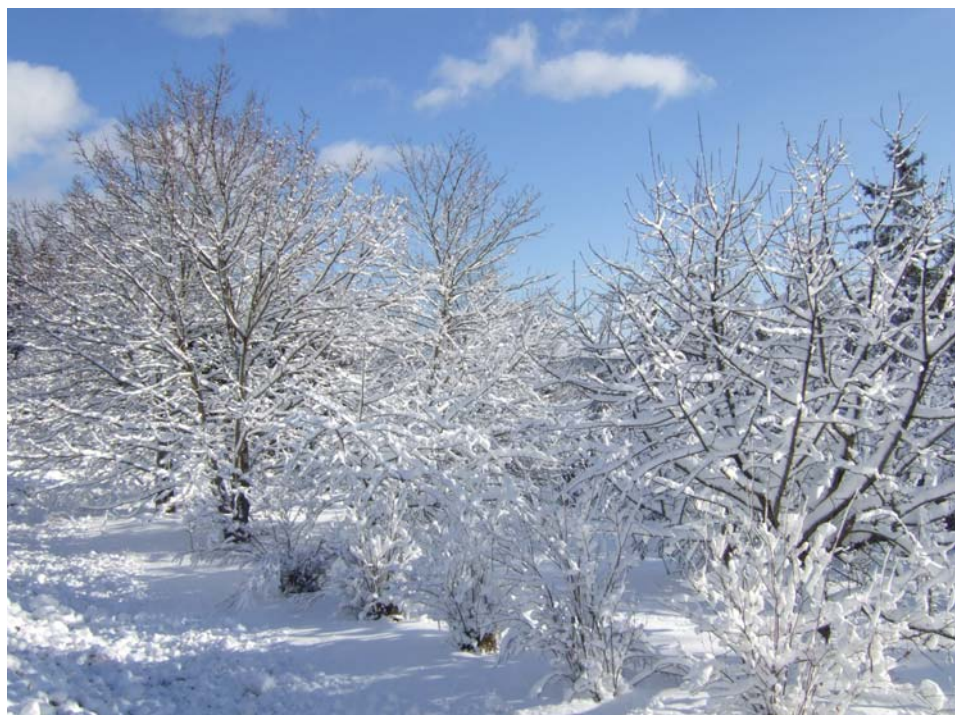
First Winter Storm of 2009, photo taken along the Dunsinane Road, Penobsquis, NB.

The Staff of Corridor Resources wishes you and your family a Wonderful Holiday Season!